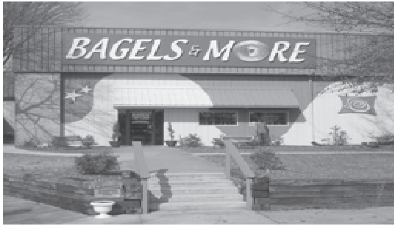
BAGEL BITES -- Reasonable prices for delicious foods.

Bagels & More is a new restaurant located in the Serendipity Café at 1555 Interstate Drive. They serve breakfast, lunch and dinner.