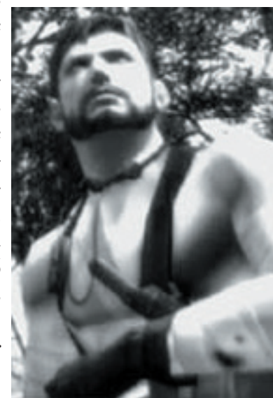
SURVIVAL OF THE FITTEST -- Snake prepares to save Amer-

Metal Gear Solid 3: Snake Eater is more exciting, intense and much more realistic than its predecessors. It features top of the line PS2 graphics, enhanced sound and voice-acting against a mind-blowing soundtrack straight from the 1960's. Metal Gear Solid veterans will be glad to know that the game also hosts a variety of fascinating new characters along with a few familiar faces. Metal Gear Solid 3 can be found in Cookeville at video stores like Sam Goody or Game Crazy for $49.99.