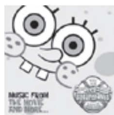
MUSIC FROM THE MOVIE AND MORE...